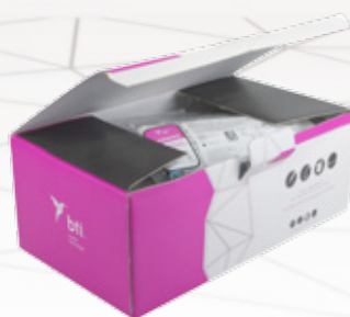
KMU-10 (It contains 10 disposable kits)