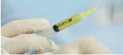
Liquid for infiltration in skin.

The versatility of ENDORET technology enables it to be adapted to different clinical uses. (8)