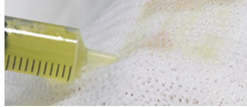
Liquid for their use as a post-treatment mask.